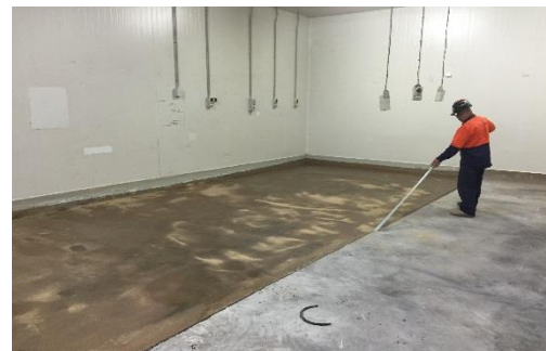
Finishing off area