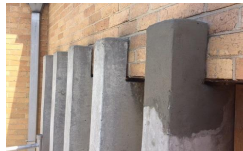
Finishing large repair