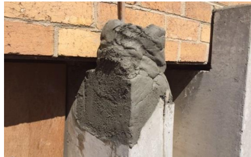
Forming large repair